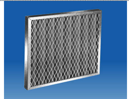
Dry Type Panel Filters

Oil wetted panel filters are available for low and high velocity applications on heating, cooling, and ventilating equipment. These filters have an all metal construction and are available in galvanized steel, aluminum, stainless steel, monel or bronze.