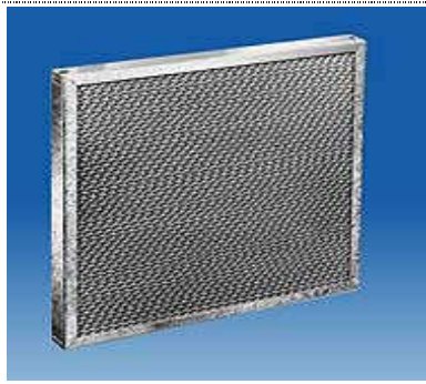
Oil Wetted Panel Filters

DM disposable media retainers are designed for safe, low cost use. There are no exposed wire ends. A 24 gauge galvanized steel frame highlights the durability of this media retainer.