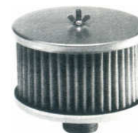
Dry Type Intake Filter Elements

Airsan Film-Cor recharging adhesive is nearly odorless, has a high flash point and rapid wetting characteristics. A dye tracer in the adhesive allows visibility of coverage. Airsan Film-Cor is U.L. approved on Airsan filters and is available in 16 oz. Aerosol cans, 1 gallon and 5 gallon cans and 55-gallon drums.